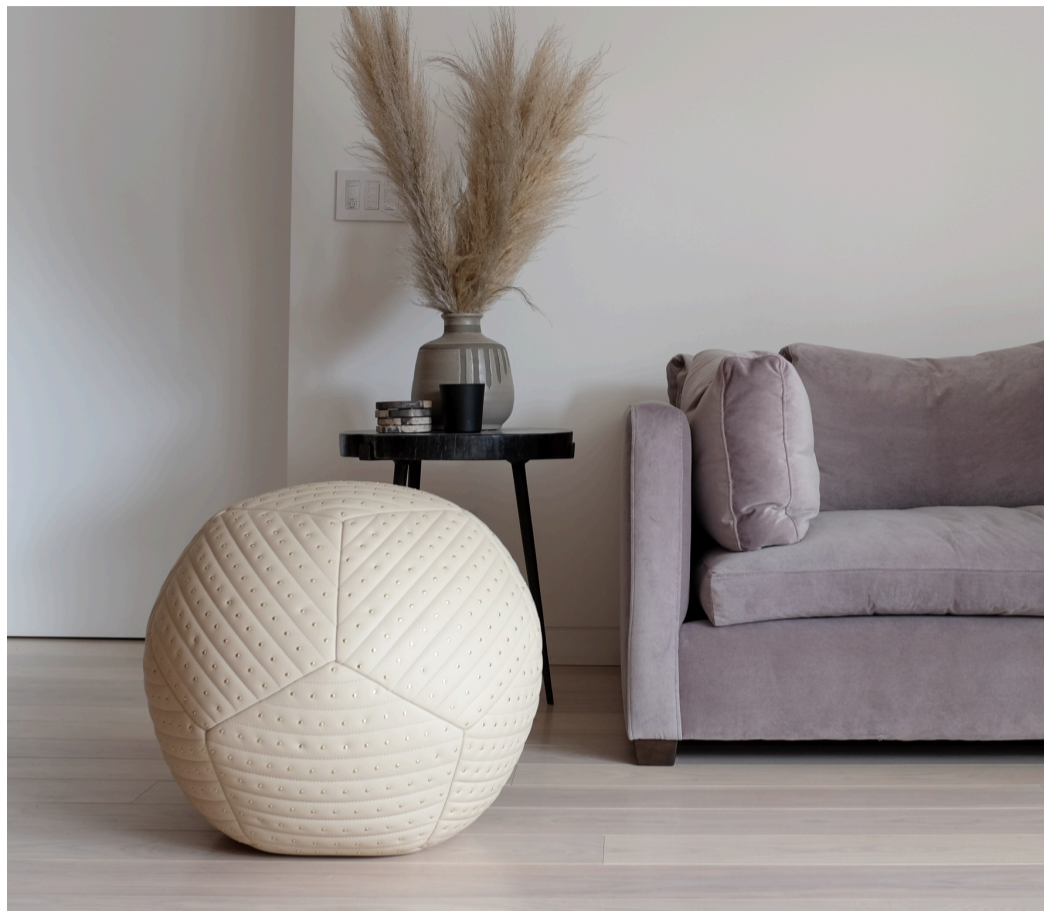
18"Ø G29 Off-White Napa Leather With Shiny Brass Studs

Twelve pentagon shaped leather panels are sewn together and stitched with parallel banding and finished with equally spaced metal studs for our round Studded Banded Ottoman. The hand-moulded fill adds structure and stability to the sculptural form creating comfortable seating with a soft presence with refined statement detail. The Studded Banded Ottoman is finished with a laced detail closure.