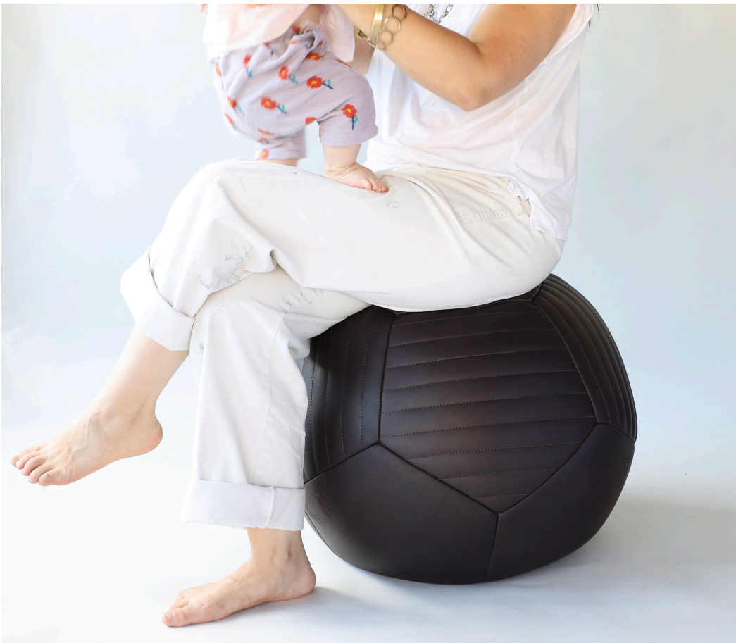
18"Ø A05 Chocolate Shasta Leather

Twelve pentagon shaped leather panels are sewn together for our round Half-Banded Ottoman; a harmonious contrast of 6 banded and 6 un-banded panels. The hand-moulded fill adds structure and stability to the sculptural form creating comfortable seating with a soft presence. The Half-Banded Ottoman is finished with a laced detail closure.