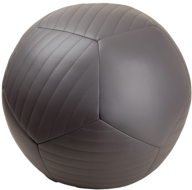
18"Ø G103 Storm Napa Leather

Twelve pentagon shaped leather panels are sewn together for our round Half-Banded Ottoman; a harmonious contrast of 6 banded and 6 un-banded panels. The hand-moulded fill adds structure and stability to the sculptural form creating comfortable seating with a soft presence. The Half-Banded Ottoman is finished with a laced detail closure.